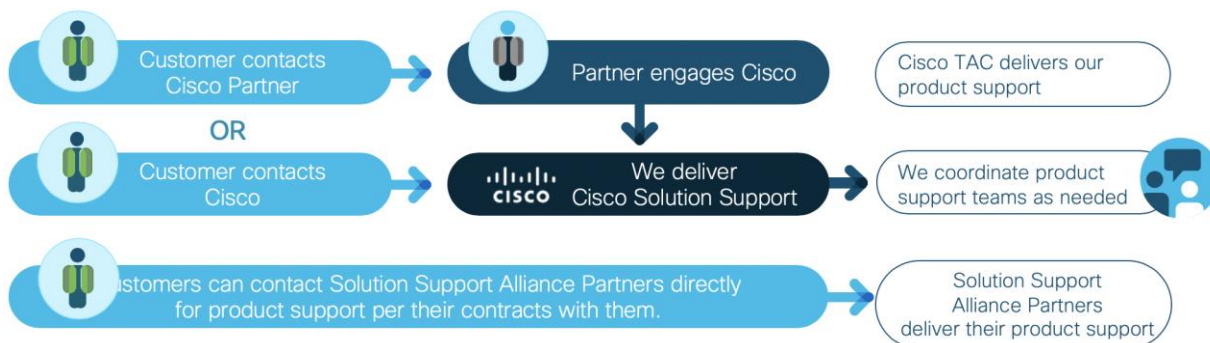
Figure 1 Cisco Solution Support Engagement Model