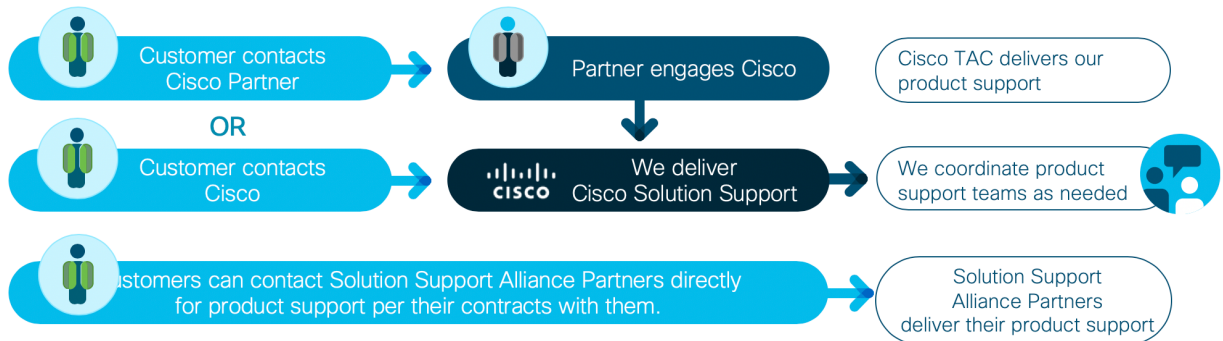
Figure 2: Solution Support Engagement Model for Multivendor Solutions