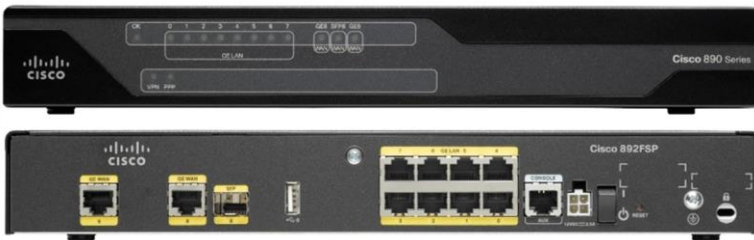
Figure 1. Cisco 892FSP ISR, Front and Back

Cisco 890 Series ISRs come with an 8-port managed switch, providing LAN ports to connect multiple devices. An optional Power-over-Ethernet (PoE) capability can also supply power to IP phones and other devices. Eleven Cisco 890 Series models are available: Figure 1 shows the front and back of one, the Cisco 892FSP.